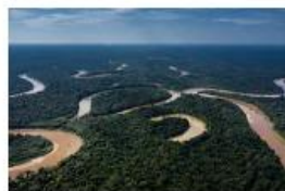
Takeaways from The Post’s investigation of deforestation in the Amazon