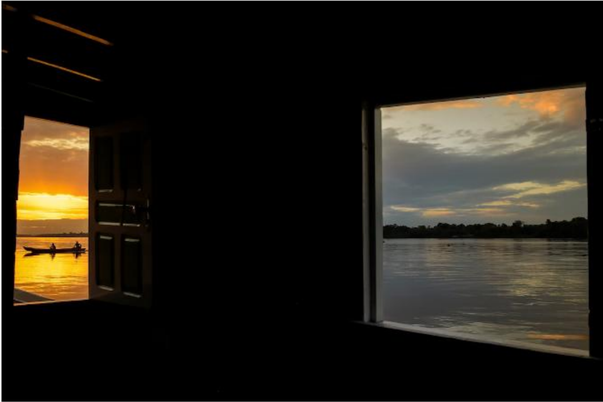
The Amazon river in Ilha de Marajo, Brazil.

The waters of the Amazon travel thousands of miles before coming to Marajó Island, half the size of Portugal, wedged between the river and the Atlantic. Most of the Amazon's water gushes northward, the shortest route to the sea. But some of it tracks south, beginning a long, circuitous path toward the Atlantic.