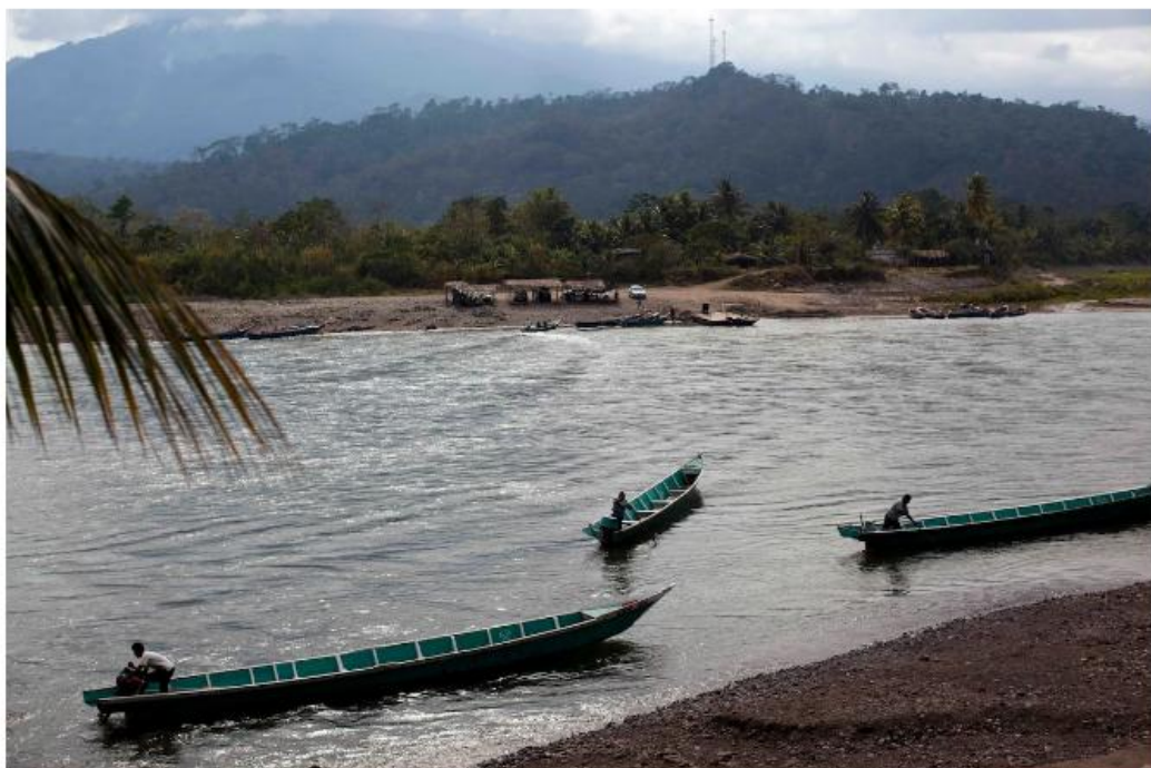
Boats await passengers to ferry across the Apurimac River in Pichari, Peru.