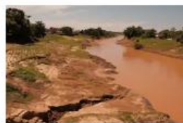
As the Amazon rainforest goes dry, a desperate wait for water