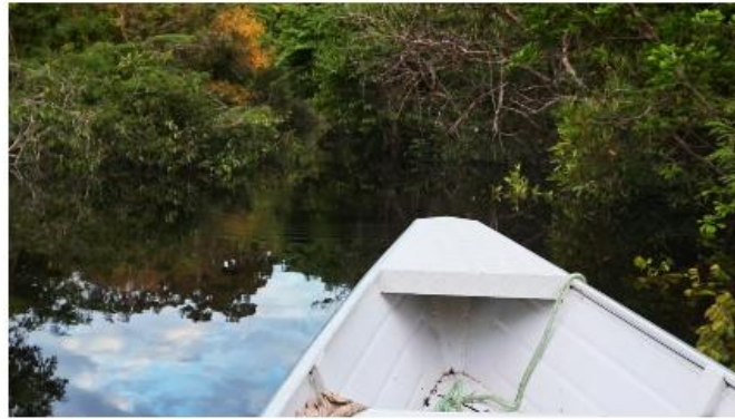
According to the U.S. Geological Survey and Britannica, the Nile is 132 miles longer than the Amazon.